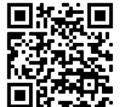
Online Offering Plate

If you are new here, please fill out our "Connect Card" on the Welcome Table by the sanctuary doors or in your pew, so we can better welcome you! You can place your card in the offering plate or hand it to Pastor Tiffany as you depart.